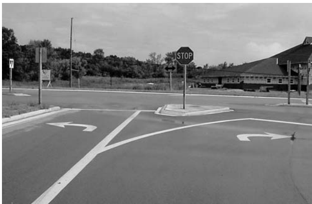
Right turn islands can be painted white.