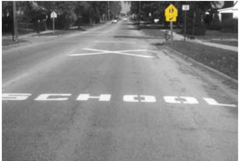
Pavement markings convey important information to drivers without diverting their attention from the road.

Paint Water-based paint, applied either cold or hot, is the most commonly used pavement marking. It is low cost with a short drying time, but its visibility on wet nights is just moderate. Traffic and snow plowing wear it away in about a year. Oil-based (alkyd) paint, when used, must meet environmental air quality restrictions on volatile organic compound (VOC) emissions.