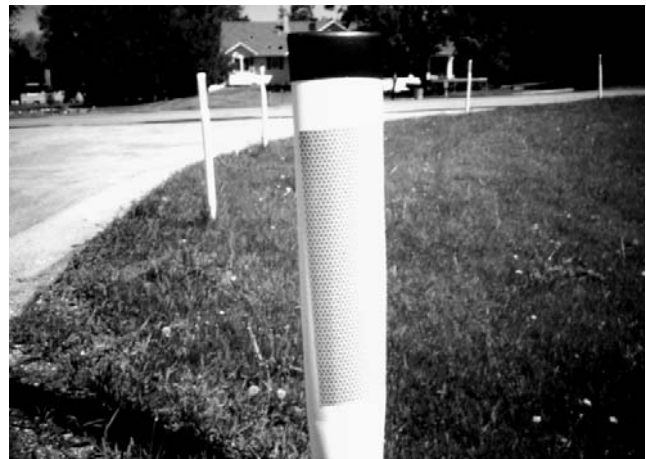
Culvert delineators are white with black at the top.

Use white delineators with black at the top to mark culverts. Delineators on horizontal curves should be spaced so that several are always simultaneously visible to the road user.