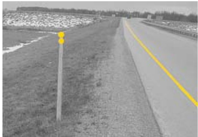
Delineators on the left side of a one-way road are yellow.

The color of a delineator shall match the edgeline it is next to. On a one-way road, for example, delineators on the left side must be yellow and white on the right. According to a Wisconsin statute delineators used to mark driveways must be blue.