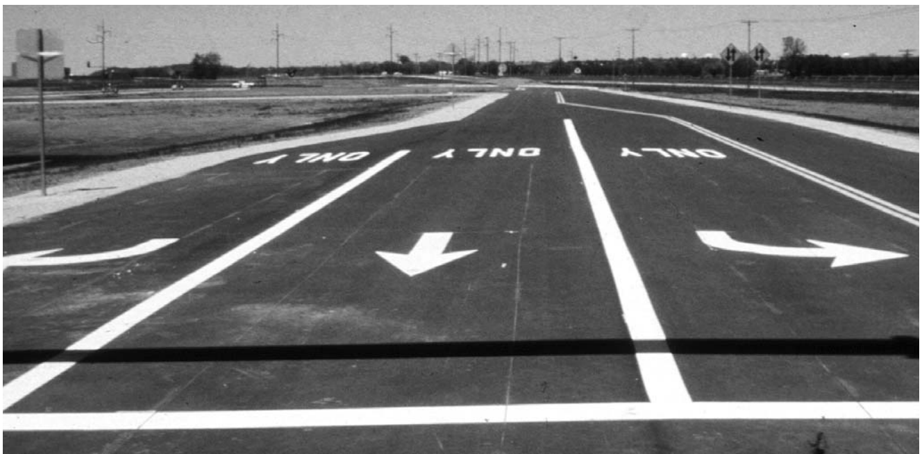
Arrow symbols channelize traffic at intersections where turns are mandatory.

All letters and symbols should conform to the standard alphabet for highway signs and pavement markings contained in Standard Alphabets for Highway Signs and Pavement Markings (Wisconsin DOT Region offices should have a copy available for you to use.) Use large